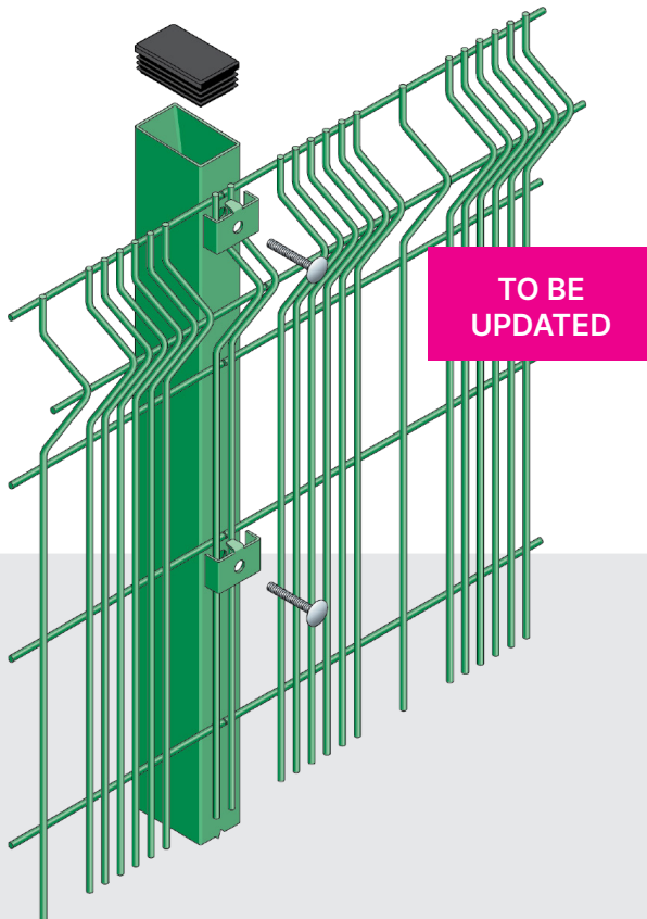
Exploded view of post and fixing details for the CLD Multiplus